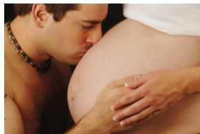
Fetal and infant death affects the whole family unit. FIMR can help us understand.