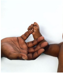
FIMR reduces fetal and infant mortality.

The purpose of the Washoe County FIMR Program is to understand how a wide array of social, economic, health, educational, environ-