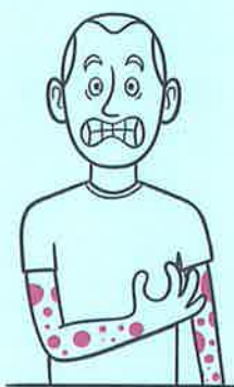
HIVES OR ECZEMA