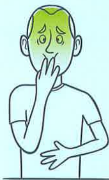
NAUSEA OR VOMITING