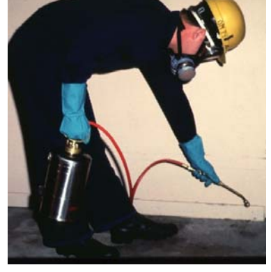
Hire a pest control operator.

Check the bed for bugs which can be quite tiny. Look for bed bug signs (including black spots on the sheets and mattress, fresh blood stains on bedding, or skin casts). Take the bugs to the Health Department or State Department of Agriculture for identification. A licensed pest control operator (PCO) can also identify the bugs or do a onsite inspection